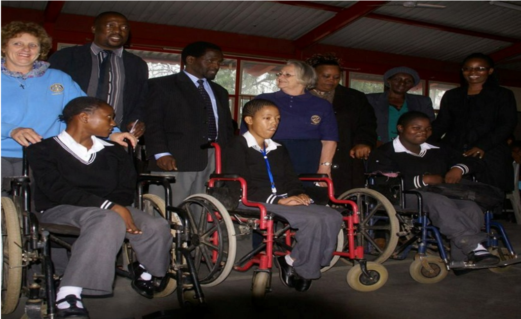
Pic 1 : 60 Wheelchairs collected by Francistown R C from our Wheelchair