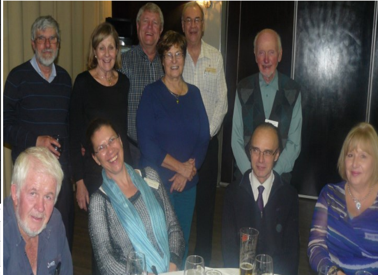
Members at our Fellowship meeting last week. Fun !