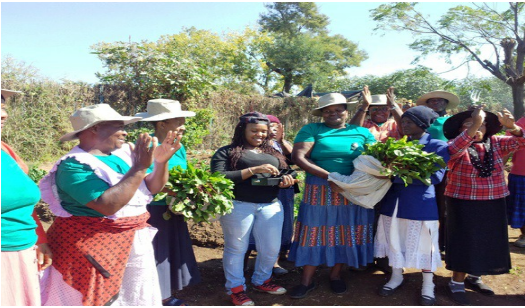
Pic 1 & 2 ; Zandspruit/Emthonjeni Kopano Gardeners showing off their latest harvest ;