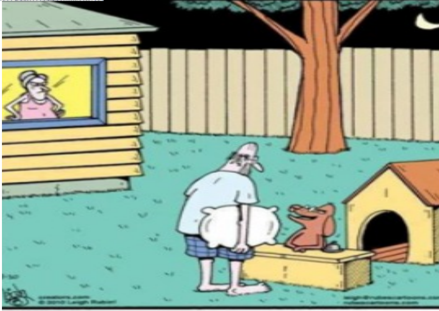
"Welcome back, sir. Are you planning on being our guest for one night only, or will this be your usual extended stay?"